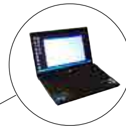
DATA CAN BE RECORDED TO A LAPTOP