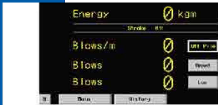
TYPICAL SCREEN SHOTS