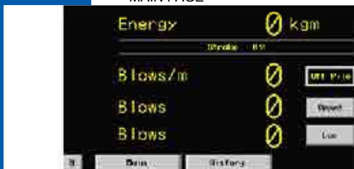
TYPICAL SCREEN SHOTS