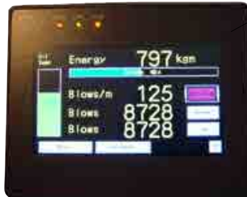
INTERFACE SCREEN MOUNTED ON POWER PACK

With constant drop weight position monitoring, the velocity of the drop weight is also known, therefore energy output can be accurately measured and is displayed to the operator on the powerpack interface screen. This information can be recorded direct to a laptop via a Dawson software interface, and can be saved in standard spreadsheet formats, giving a blow by blow account of every pile driven and a day to day productivity record.