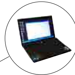
DATA CAN BE RECORDED TO A LAPTOP