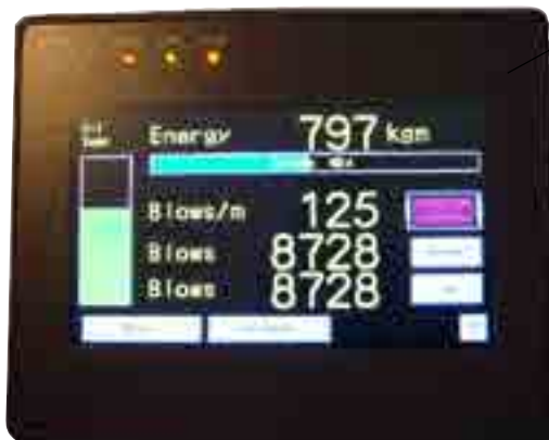
INTERFACE SCREEN MOUNTED ON POWER PACK

With constant drop weight position monitoring, the velocity of the drop weight is also known, therefore energy output can be accurately measured and is displayed to the operator on the powerpack interface screen. This information can be recorded direct to a laptop via a Dawson software interface, and can be saved in standard spreadsheet formats, giving a blow by blow account of every pile driven and a day to day productivity record.