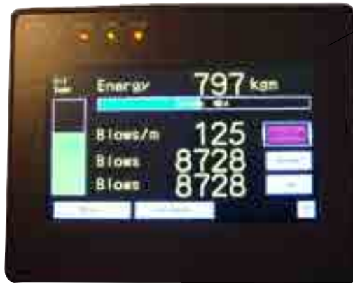
INTERFACE SCREEN MOUNTED ON POWER PACK

With constant drop weight position monitoring, the velocity of the drop weight is also known, therefore energy output can be accurately measured and is displayed to the operator on the powerpack interface screen. This information can be recorded direct to a laptop via a Dawson software interface, and can be saved in standard spreadsheet formats, giving a blow by blow account of every pile driven and a day to day productivity record.